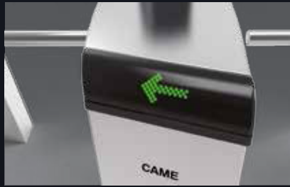
OPEN AND FUNCTIONAL ENTRY OR EXIT LANE.