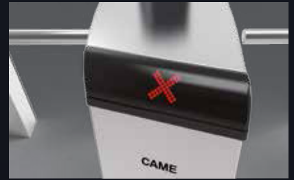
BLOCKED ENTRY OR EXIT LANE.